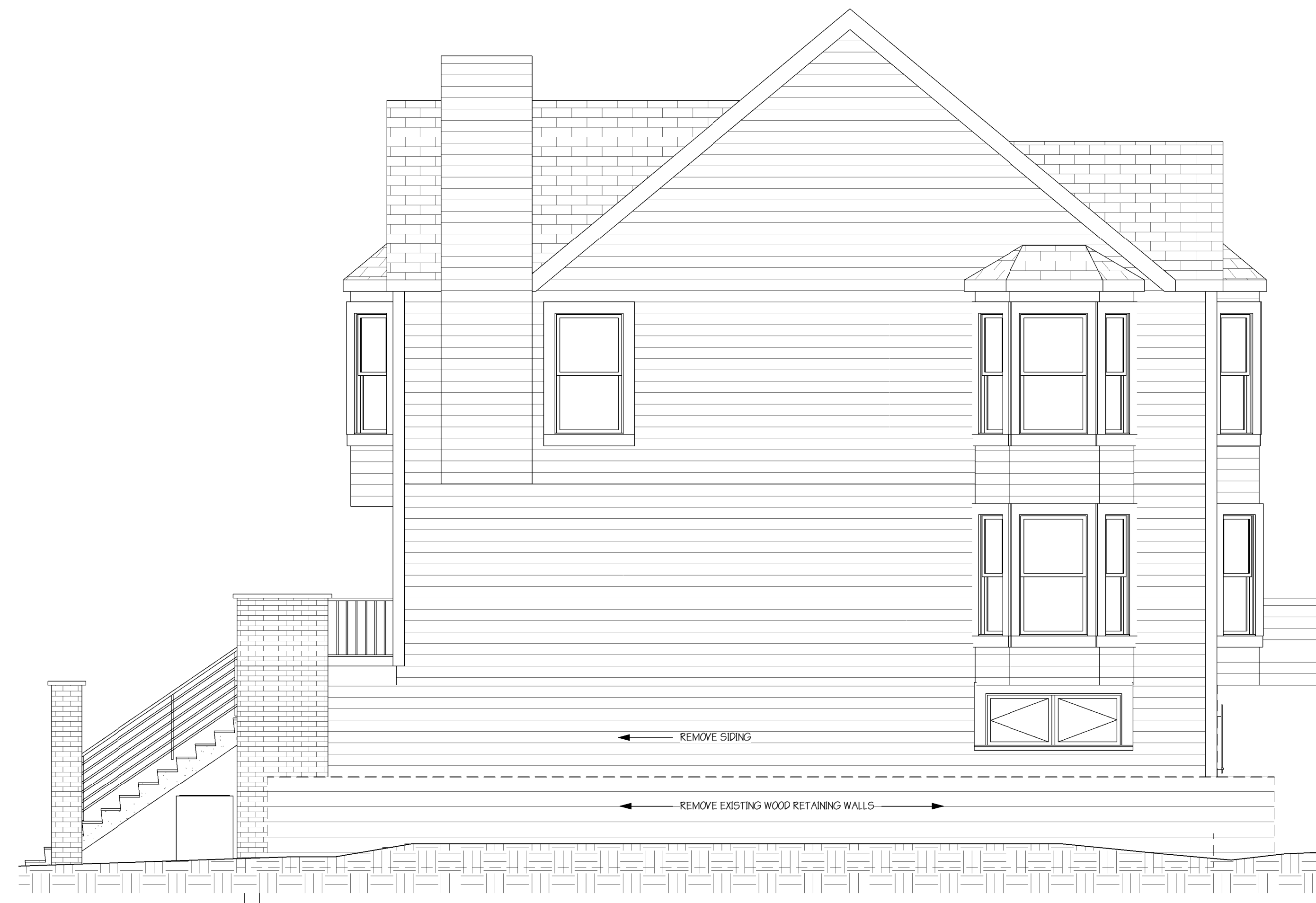
3 BLDG 3 SOUTH DEMO 1/4" = 1'-0"