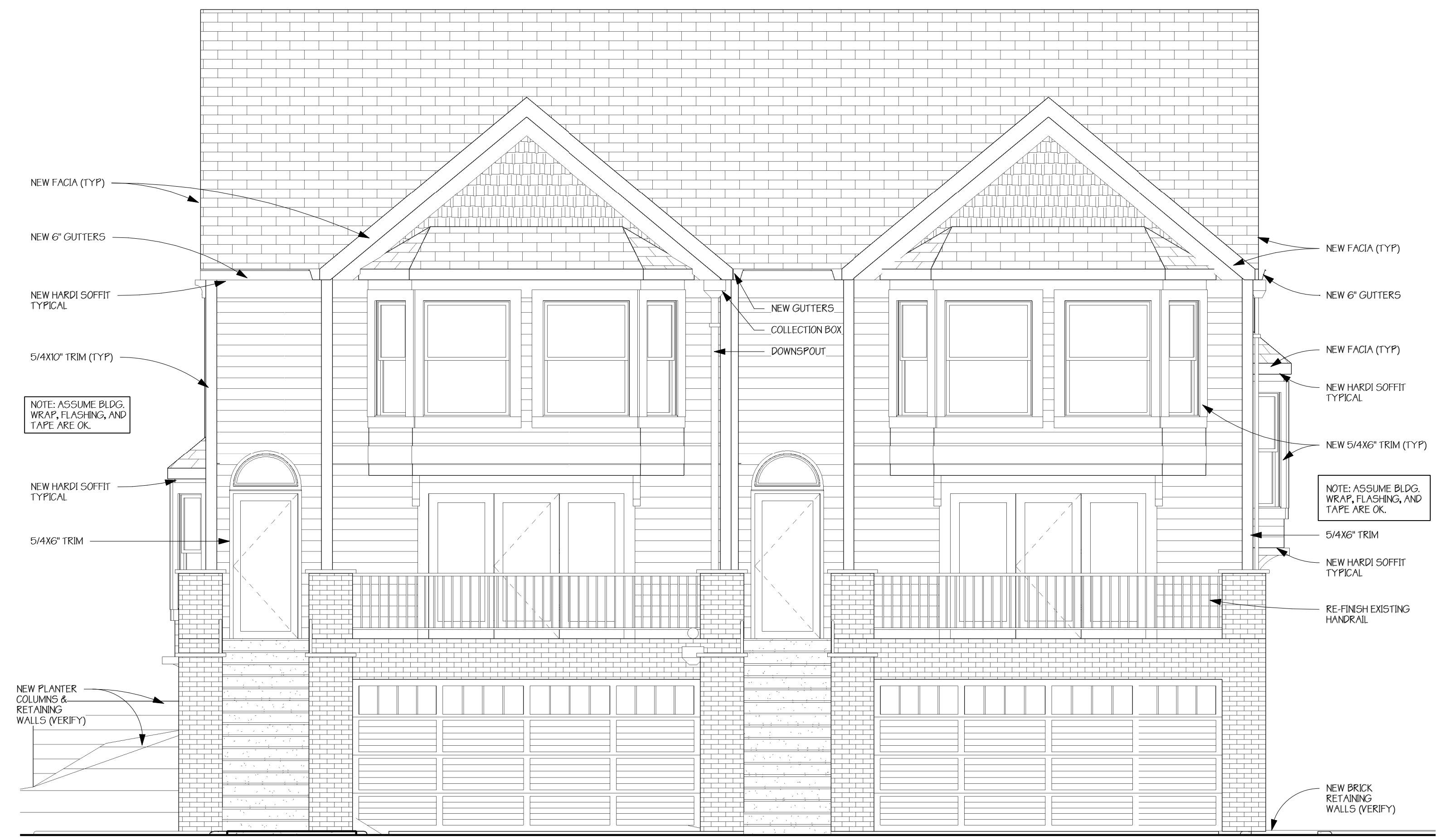
1 BLDG 4 FRONT A11 1/4" = 1'-0"