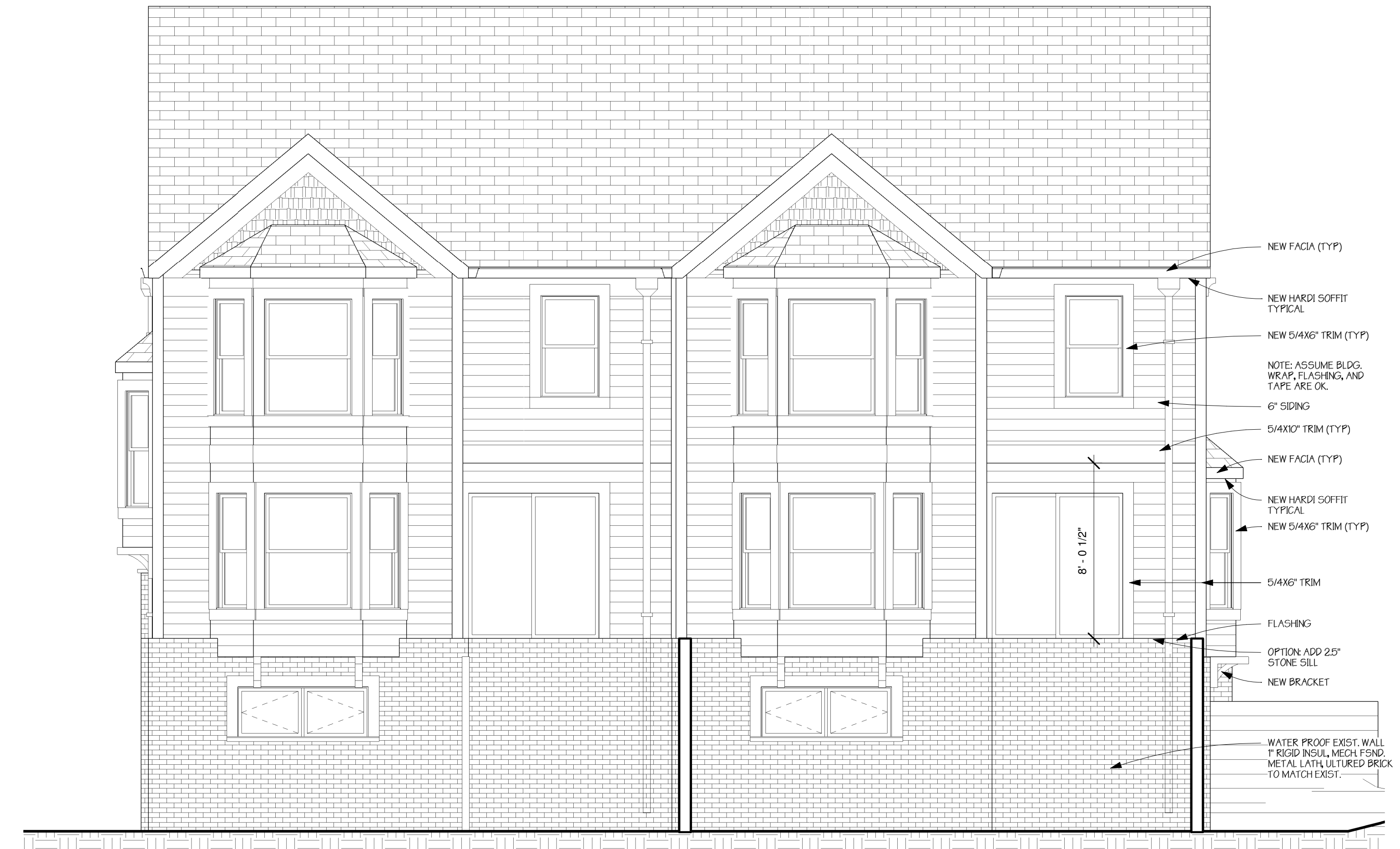
3 BLDG 4 BACK A11 1/4" = 1'-0"