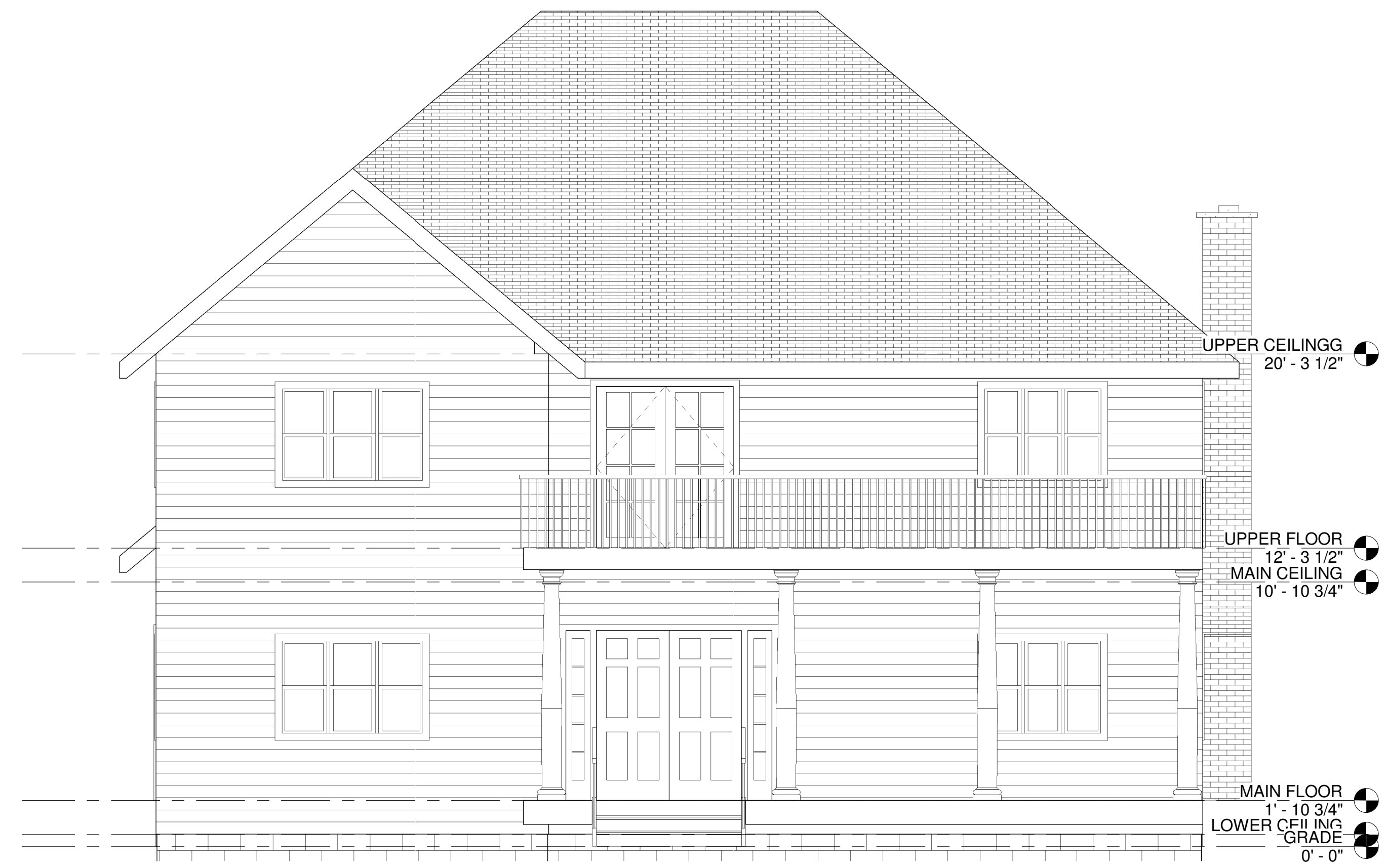
① South 1/4" = 1'-0"