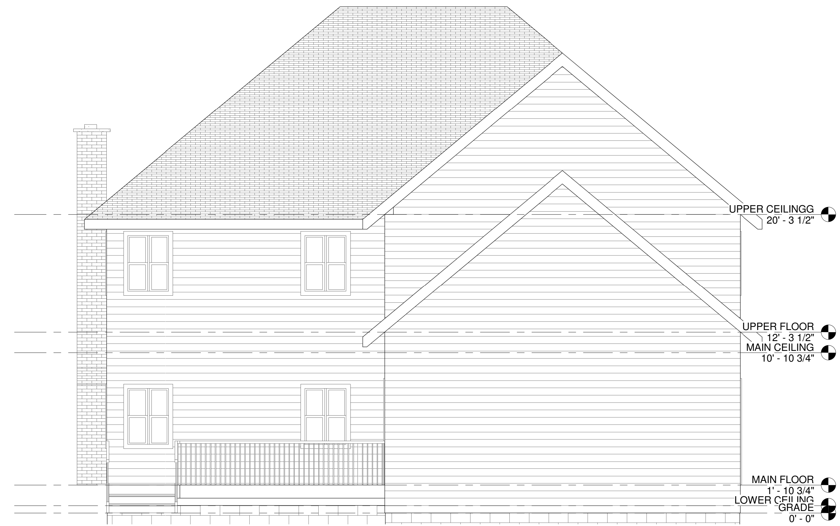
② North 1/4" = 1'-0"