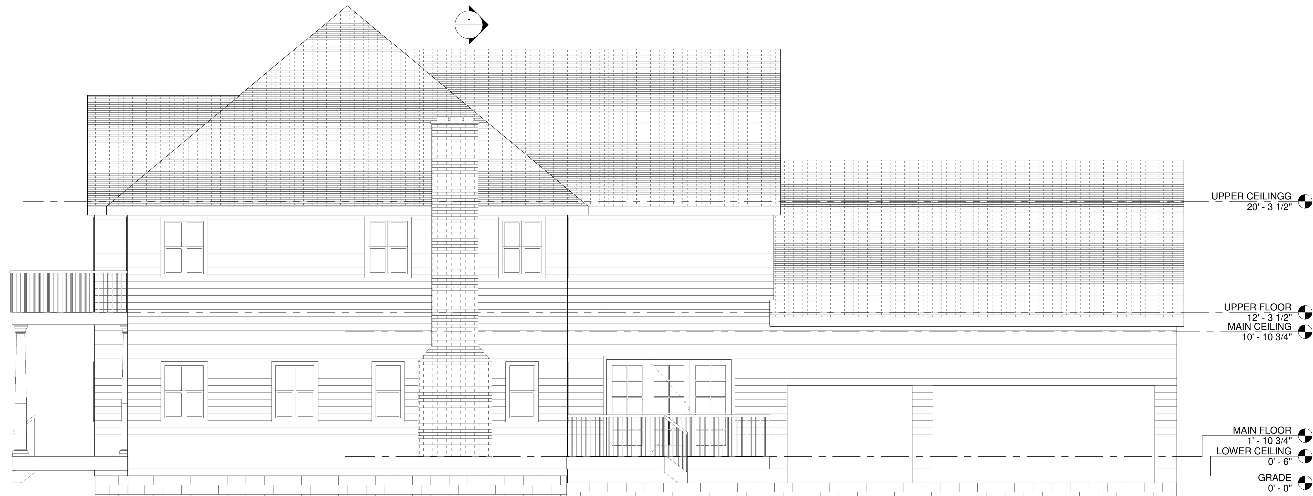
③ East 1/4" = 1'-0"

BRUCE Knutson 530 NORTH 3RD ST. SUITE 530 MINNEAPOLIS, MN. 55401 PHONE 612-332-8000 FAX 612-332-7504 WWW.KNUTSON-ARCHITECTS.COM