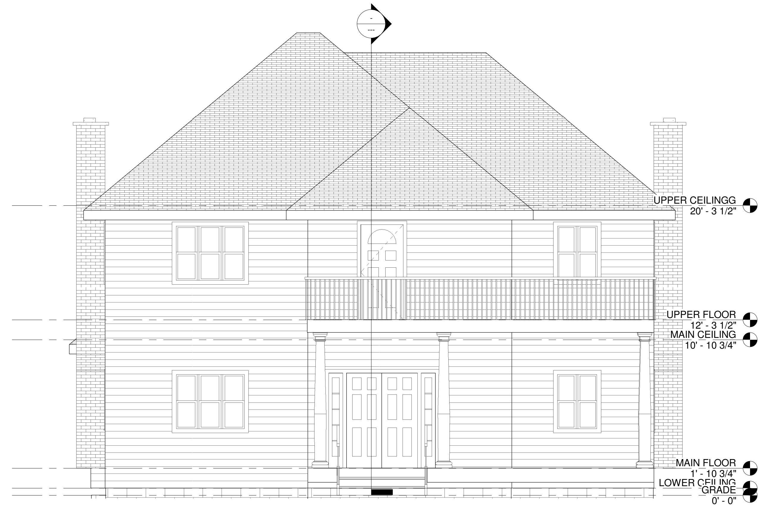
① South 1/4" = 1'-0"