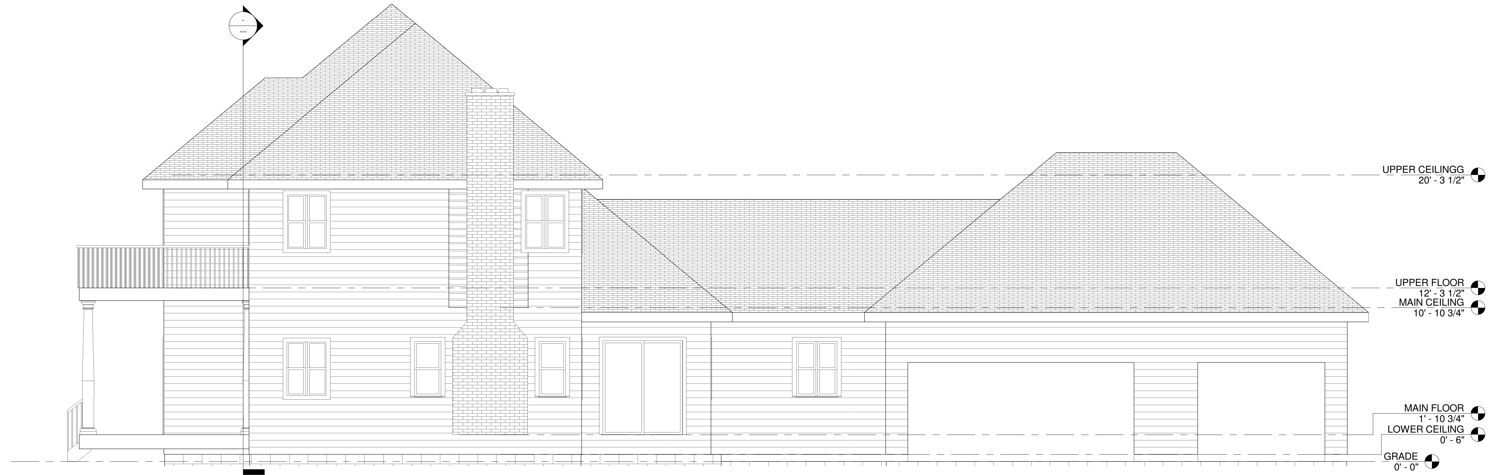
③ East 1/4" = 1'-0"