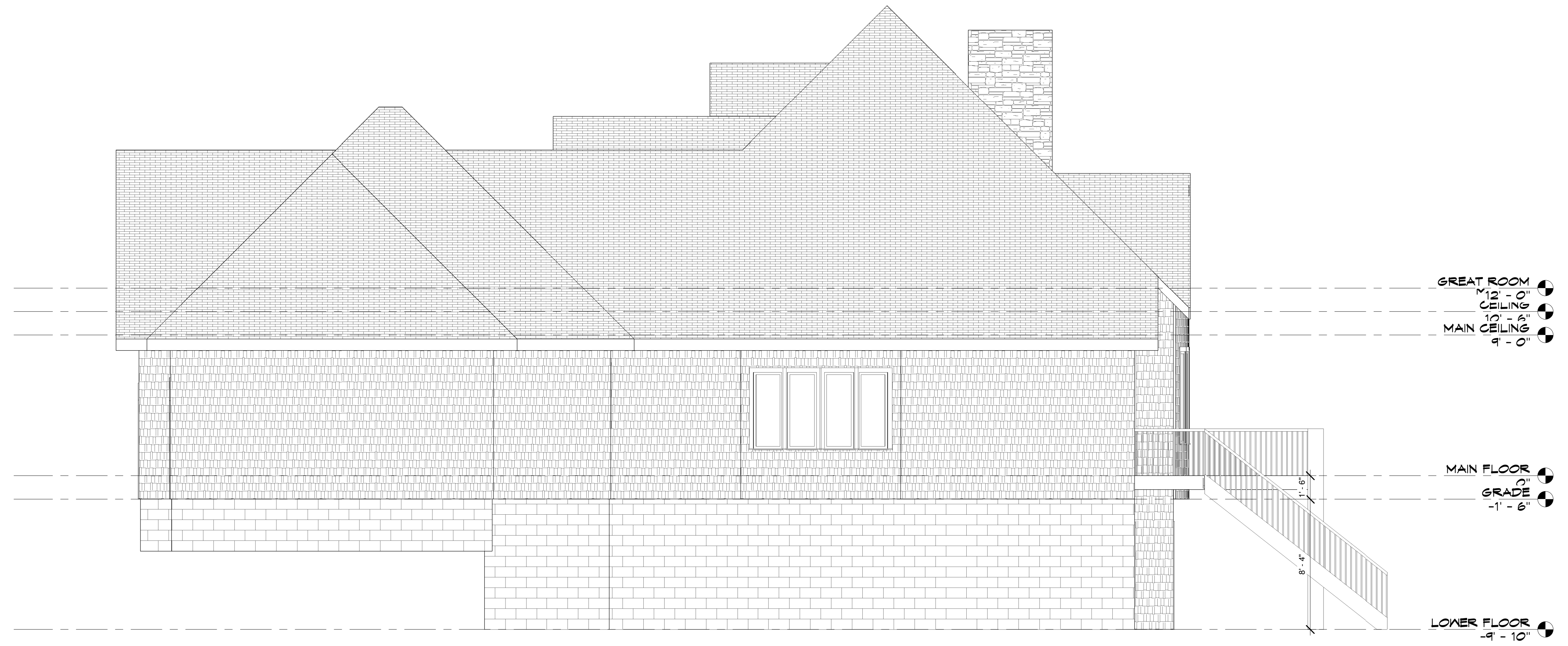
1 EAST EXIST AS 1/4" = 1'-0"

CONTRACTOR TO VERIFY ALL DIMENSIONS, AS BUILT CONDITIONS (IF APPLY) AND SITE CONDITIONS, BEFORE ORDERING MATERIAL OR DEMOLISHING EXISTING STRUCTURES. CONTRACTOR AND ALL SUBS MUST REPORT ANY DISCREPANCIES TO DESIGNER IMMEDIATELY. AS BUILT AND SITE CONDITIONS OFTEN HAVE UNIQUE CONDITIONS THAT CANNOT BE PREDICTED OR FORSEEN AT DESIGN COMPLETION. CONTRACTOR, SUBS AND DESIGNER WILL WORK TOGETHER TO REACH A SOLUTION IF ANY SITUATION MAY ARISE.