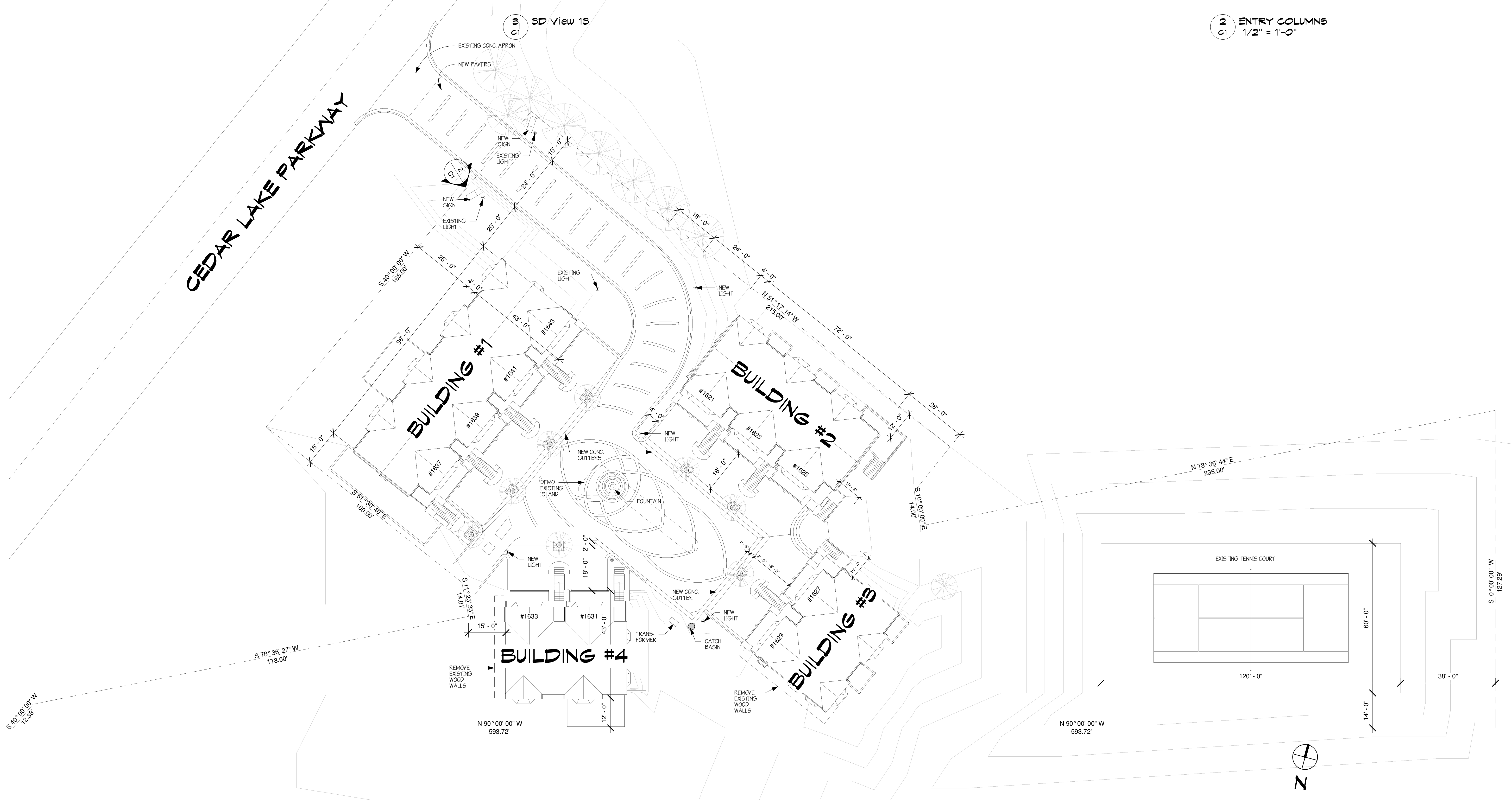
1 Site C1 1" = 20'-0"

BRUCE Architects KNUTSON 2388 UNIVERSITY AVE. W. SUITE 100 ST. PAUL, MN 55114 PHONE 612.332.8000 FAX 612.332.7504 WWW.KNUTSON-ARCHITECTS.COM