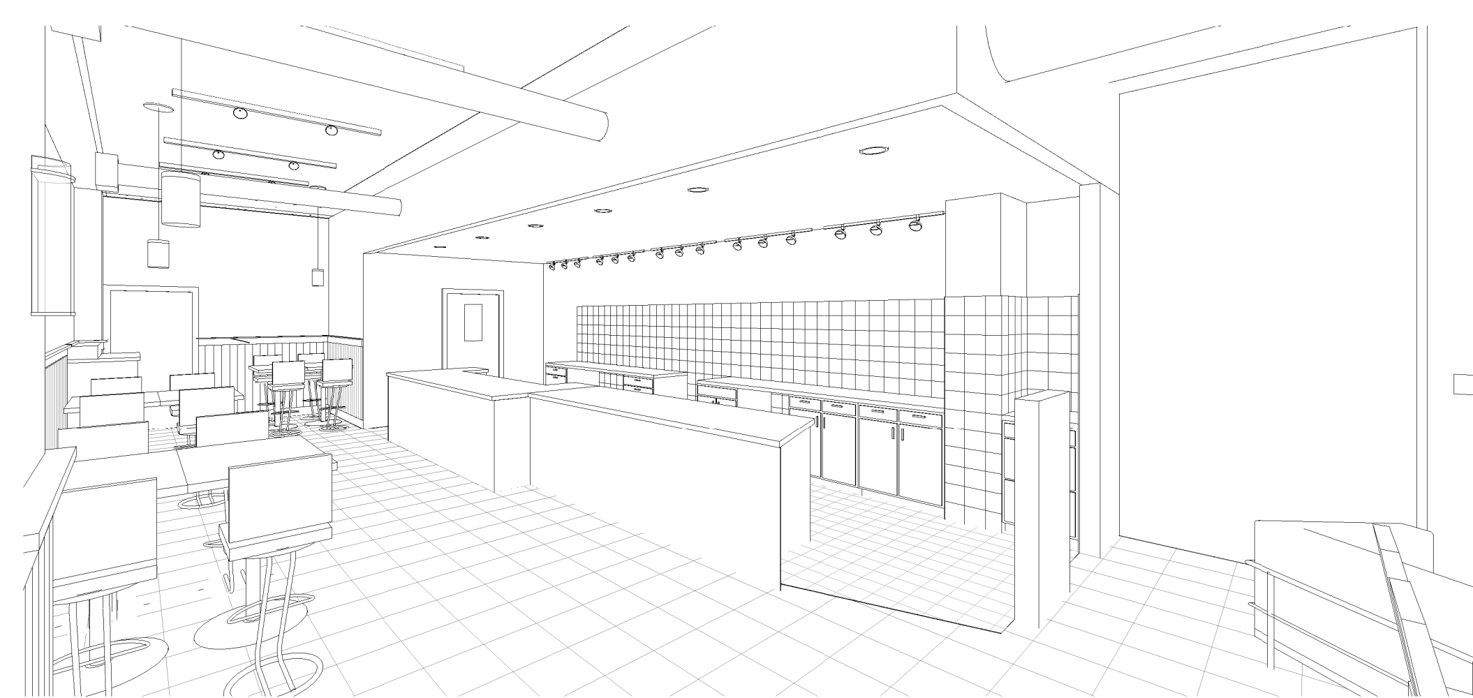
5 SERVICE COUNTER A1