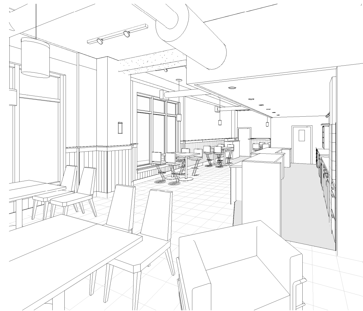
4 3D View 3 A1