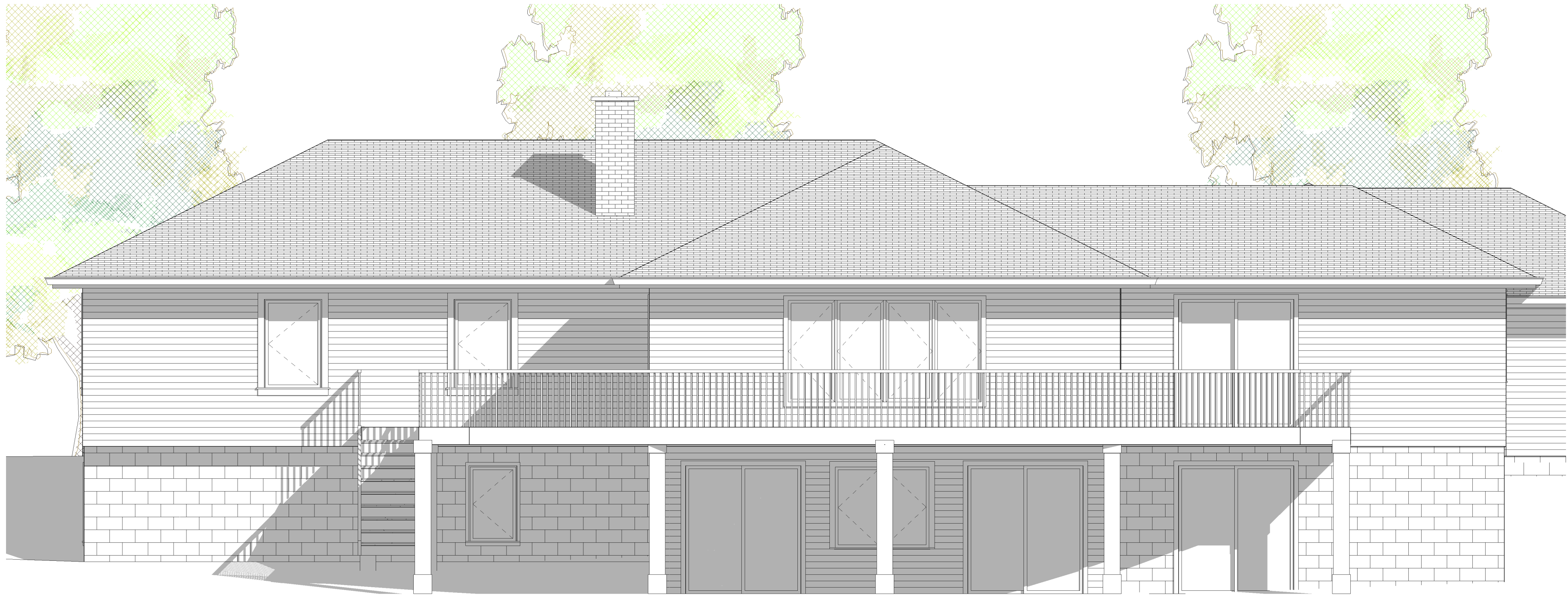
1 SOUTH A5 1/4" = 1'-0"