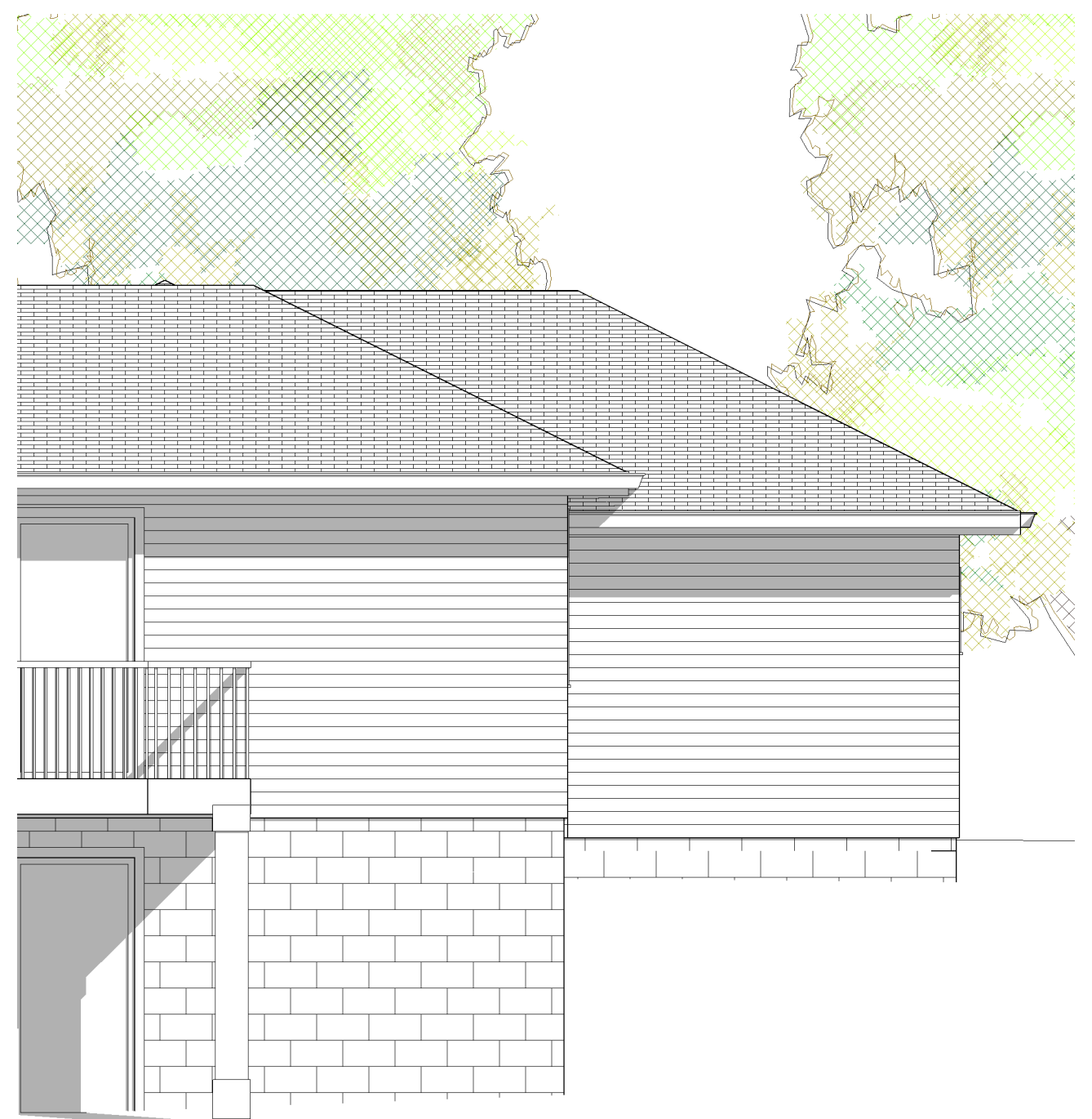
2 SOUTH GARAGE A5 1/4" = 1'-0"