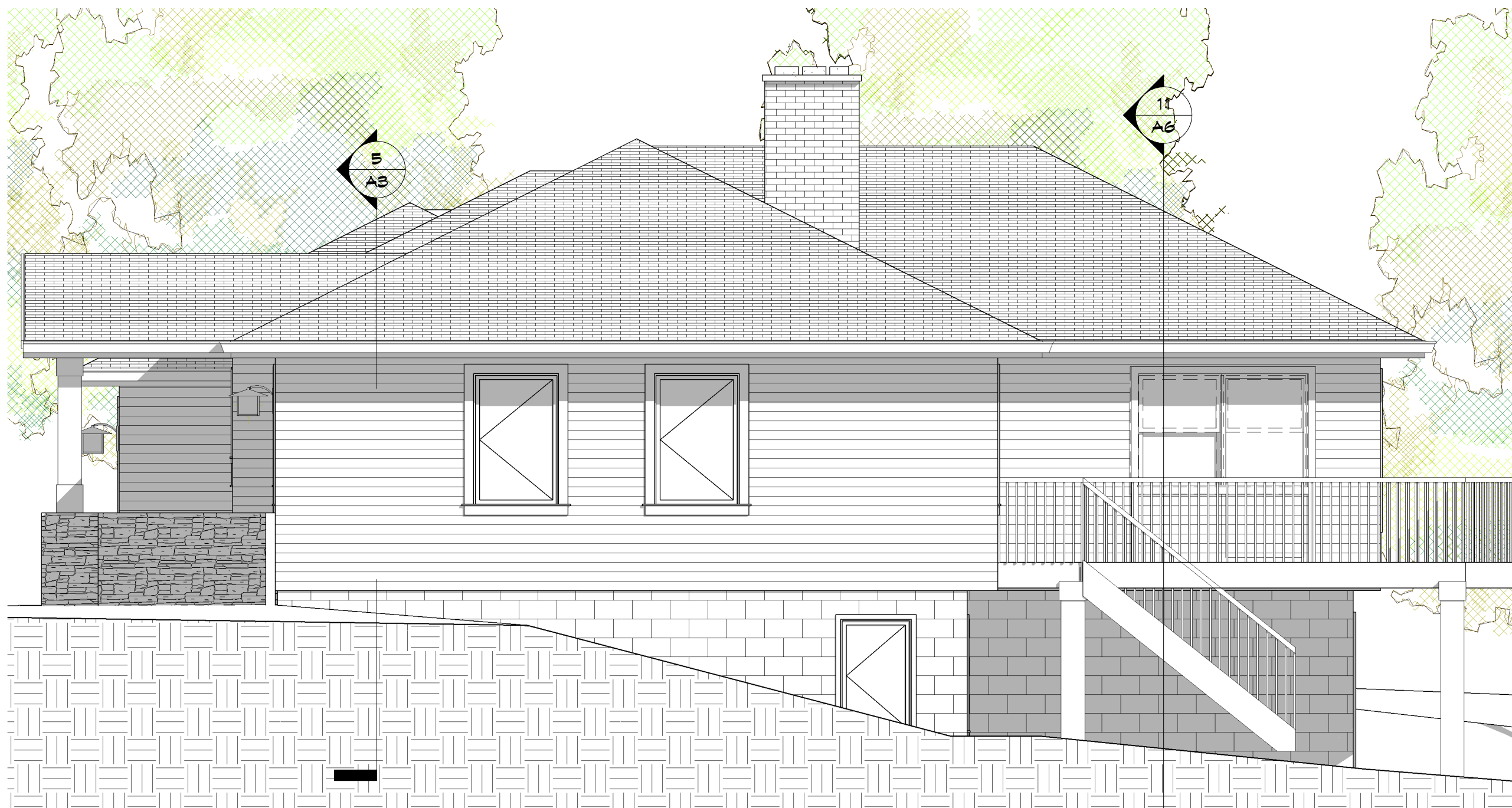
3 WEST A5 1/4" = 1'-0"