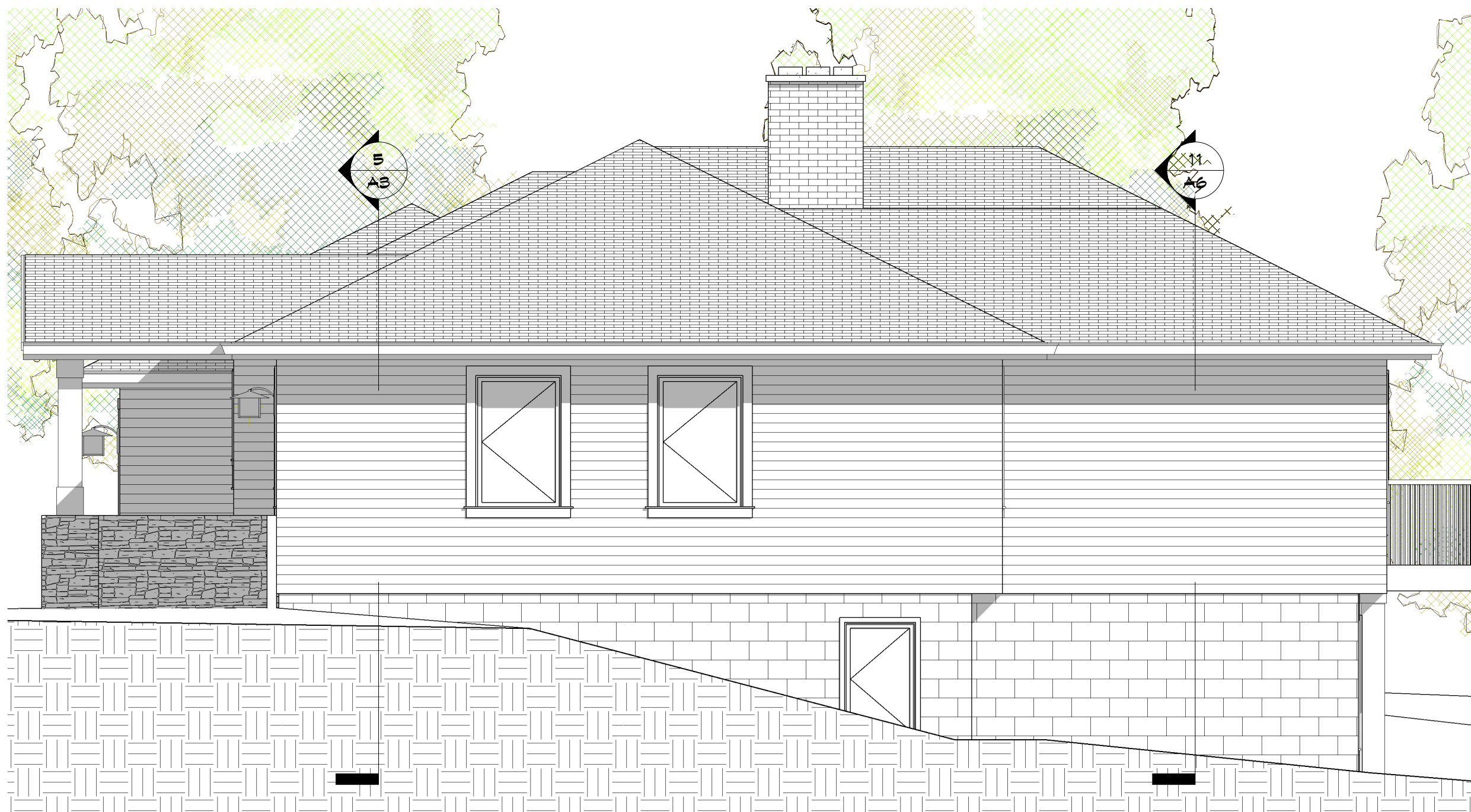
3 WEST A5 1/4" = 1'-0"