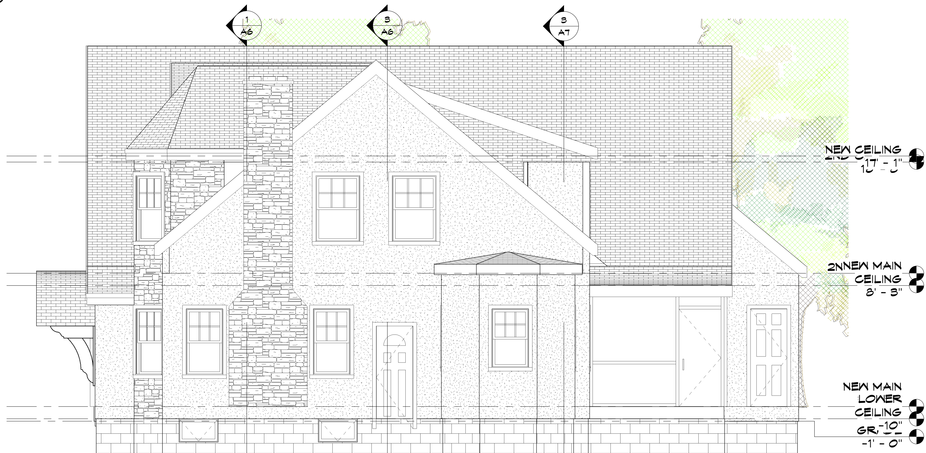
2 SOUTH A4 1/4" = 1'-0"