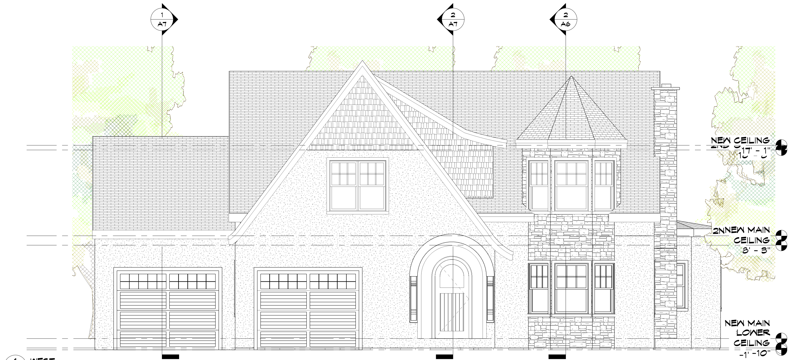
1 WEST A4 1/4" = 1'-0"