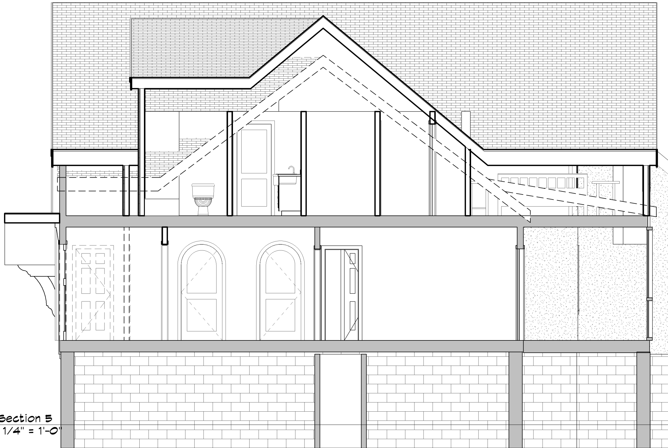
2 Section 5 A7 1/4" = 1'-0"