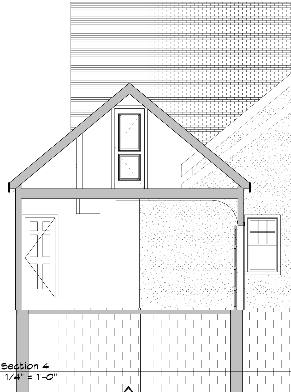
1 Section 4 A7 1/4" = 1'-0"