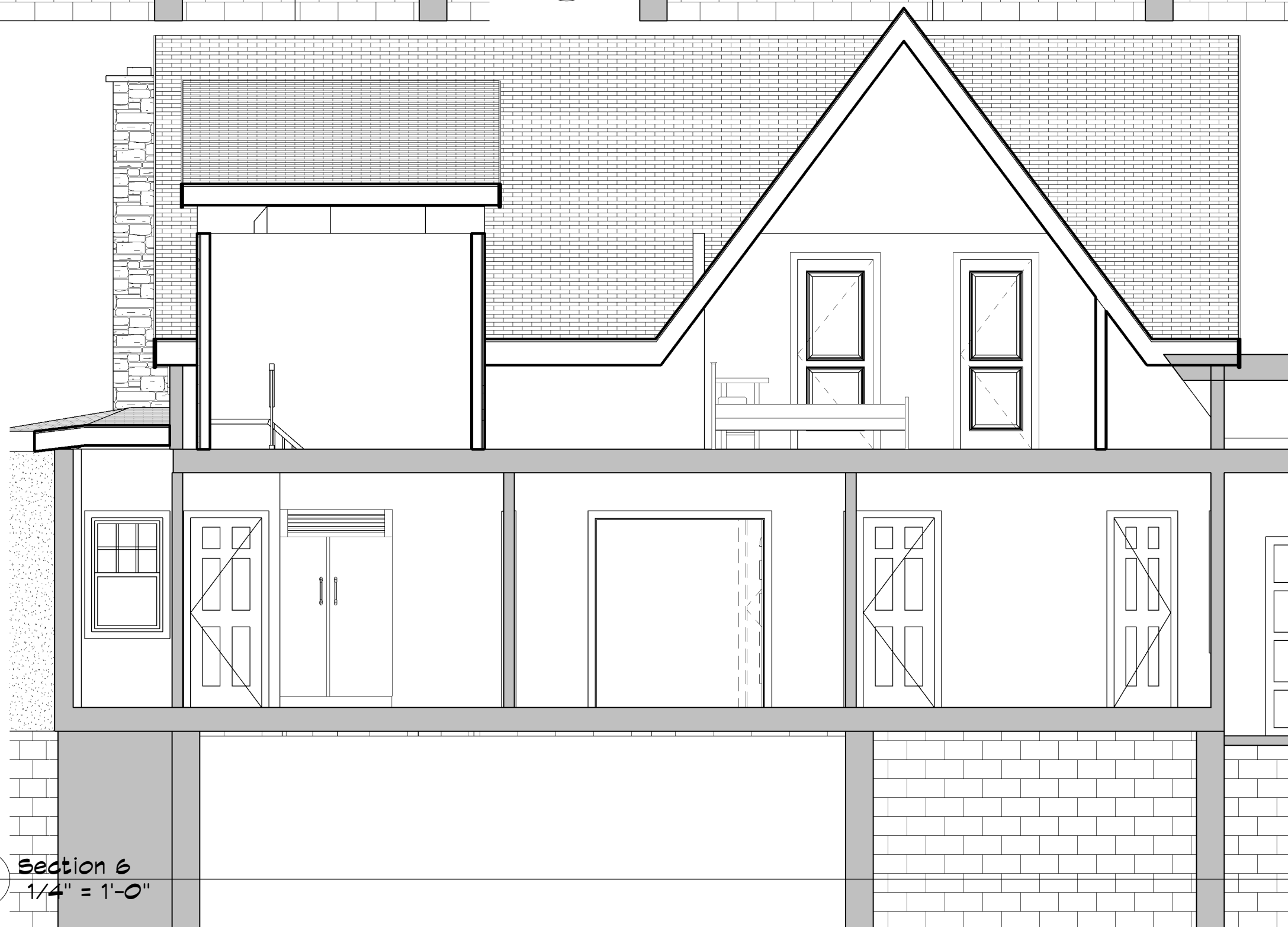
3 Section 6 A7 1/4" = 1'-0"